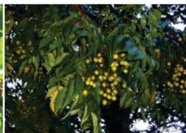
Figure 3. Melia azedarach