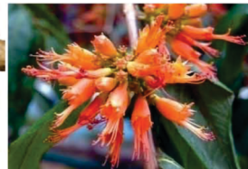
Figure 10. Woodfordia fruticosa