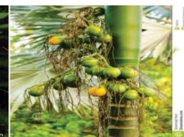
Figure 7. Areca catechu