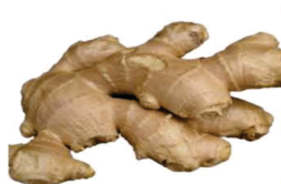
Figure 9. Zingiber officinalis