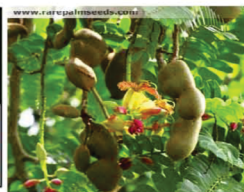
Figure 2. Tamarindus indicus