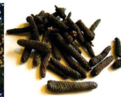
Figure 4. Piper longum