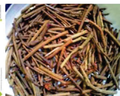
Figure 8. Rubia cordifolia