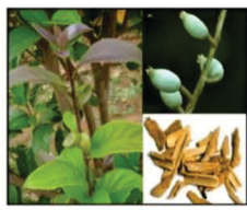
Figure 1. Symplocos racemosa