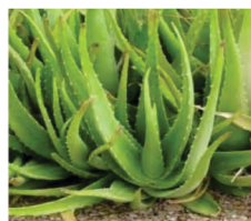
Figure 5. Aloe vera