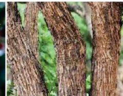
Figure 11. Acacia Arabica