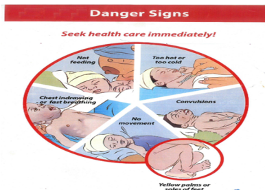
Fig 2: Pictorial parent guide