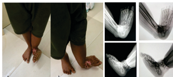
Figure 1- A & B showing calcaneo valgus deformity with a chronic discharging sinus on the dorsum of the foot. Xray of the foot & ankle showing severe osteopenia, with destruction of the ankle joint and tibiaofibular ankylosis

10-year-old male came with deformity of the left ankle and foot following the history of snakebite injury five months back. The patient was managed conservatively at the time of injury and later progressed to develop chronic osteomyelitis of the distal tibia, talus and calcaneum. Patient on presentation had a talipes-calcaneo-valgus deformity, with discharging sinus (Figure 1, 2). The patient underwent deformity correction by supra malleolar osteotomy, bone grafting and tibiotalar calcaneal arthrodesis with Steinman pin (Figure 3). The soft tissue defect closed with primary reverse sural artery flap. Postoperatively, the patient underwent multiple debridement procedures, and defect finally closed with a split skin graft. The patient after 2 month follow-up does not have any discharge from the foot, Steinman pins removed. The arthrodesis is uniting with no persistent visible deformity and soft tissue defect (Figure 4). Thus, primary arthrodesis helped achieve the objectives of deformity correction.