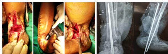
Figure 3- Anteromedial approach to ankle joint, supra malleolar osteotomy done and arthrodesis done with Steinman pin