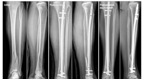
4 Months follow up