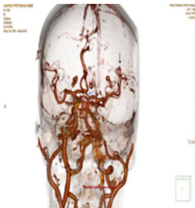
Fig-5(b)-3d CTA Shows Willisian Collateral Supplying Left Middle Cerebral Artery And Distal Cortical Branches (black Arrow) through Anterior Communicating Artery (ACOM) (blue Arrow).