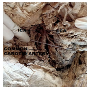
Fig 2: Higher Bifurcation Of Common Carotid Artery