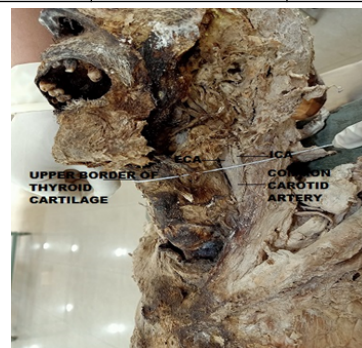
Fig:1 Standard Bifurcation Of Common Carotid Artery