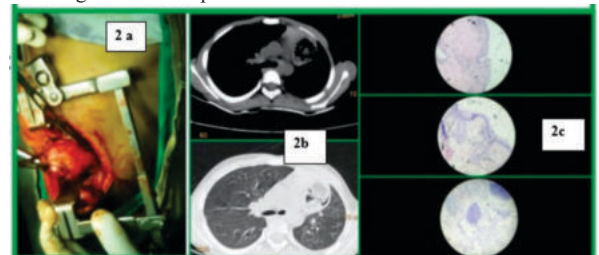
Figures 2a- Intraoperative image of thoracotomy with resection of mass.

It was suggestive of a mediastinal matured teratoma with bronchiectasis, pneumonitis and hemorrhage in lung tissue. So, the final diagnosis was a ruptured mediastinal teratoma.