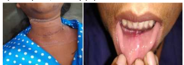
Figure 4: Postoperative scar of open Thyroidectomy and TOETVA.