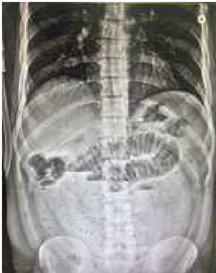
Figure 1: X-Ray FPA : Gaseously distended bowel loops in the central abdomen.

Written informed consent was obtained from the patient for the publication of this case report and accompanying images. A copy of the written consent is available for review by the Editor-in-Chief of this journal upon request.