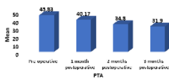
Figure 3-Improvement in PTA in cases with COM following surgery