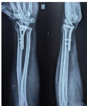
6 Months Follow Up