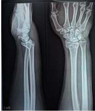
Pre Operative Radiograph

branch of radial nerve, which lies beneath brachioradialis muscle. Open both Volar and dorsal sheath of flexor carpi radialis tendon and retract FCR tendon towards ulna Identify and retract flexor pollicis longus towards ulna Identify and make Inverted L shaped incision over pronator quadratus and retract muscle towards ulna The fracture line is now clearly visualised and reduced by manipulation and ligamentotaxis and confirmed the same under c-arm Provisional k-wires may be used to maintain reduction The appropriate plate with 2.7mm and 3.5mm screws is applied. Pronator quadratus sutured covering the distal end of plate to prevent tendon irritation. The plate functions in two ways – buttress the distal fragment and maintains metaphyseal reduction