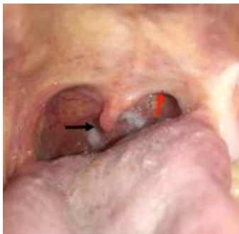
Fig. 3 : A completely healed ulcer with fibrosis on the soft palate causing narrowing of the fauces (red arrow) and slight uvula deviation to the right (black arrow) post-completion 6 cycles of R-CHOP.

Lymphomas are malignant neoplasms of lymphoid origin, characterized by a broad spectrum of clinical presentations and histopathological features. They are primarily classified into two major types: Hodgkin lymphoma (HL) and non-Hodgkin lymphoma (NHL), each exhibiting distinct biological behavior and treatment responses. Approximately two-thirds of NHL cases present with nodal involvement—typically in regions such as the cervical, axillary, or inguinal lymph nodes. The remaining third arises in extranodal locations, including Waldeyer's ring, oral cavity, oropharynx, gastrointestinal tract, testes, thyroid, skin, breast, bone, brain, or other visceral organs [13].