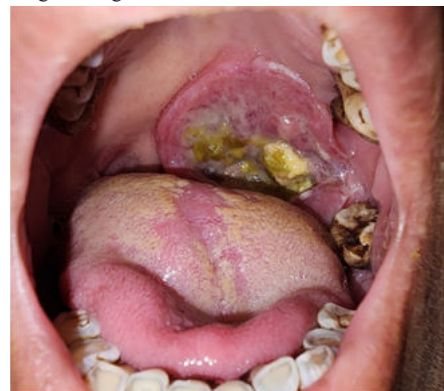
Fig. 1 : A single, irregularly edge ulcer with necrotic base over the left soft palate involving anterior tonsillar pillar at presentation.

On general examination, the patient appeared moderately nourished, well-hydrated, and clinically stable. Vital signs were within normal limits, and there were no signs of anemia or sepsis. A single, palpable upper cervical lymph node was noted on the left side, measuring approximately 3 × 2 cm. No lymphadenopathy was detected in the axillary or inguinal regions. Cranial nerve function was intact.