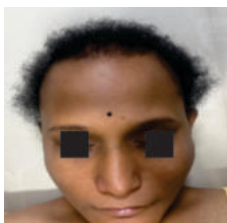
Figure 1 short, tight and irregularly curled hair giving wool like appearance present over scalp.

Based on the clinical phenotype, absence of cardiac involvement, and histopathologic findings, a diagnosis of Skin Fragility–Woolly Hair Syndrome was established.