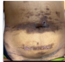
Fig 2 Multiple crusted erosions present over lower abdomen, multiple post inflammatory hyper pigmented macules present over abdomen.