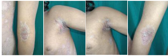
Fig-1: Inverse psoriasis characterized by sharply demarcated erythematous plaques localized to intertriginous regions.

Pustular psoriasis was observed in 13 (2.24%) cases. Erythrodermic psoriasis, a relatively severe variant, was seen in 11 (1.9%) patients and showed a slight female predominance (6 females, 5 males).