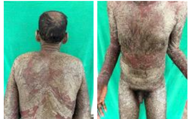
Figure 4 - Erythrodermic psoriasis showing generalized erythema and scaling involving nearly the entire body surface.

In this study, chronic plaque psoriasis emerged as the most common variant, accounting for 71.03% of cases. This finding is consistent with previous studies, including those by Griffiths CEM et al. and Dogra S et al., which have also reported plaque psoriasis as the predominant clinical type. The high prevalence of this variant reflects its chronic course and higher likelihood of presentation to tertiary care centres.