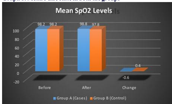
Graph 2: Mean SpO2 levels in both the groups