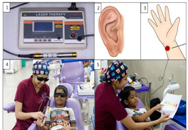
Fig 1: LASER equipment ; Fig 2: Shenmen 1 point; Fig 3: Shenmen 2 point; Fig 4: LASER application; Fig 5: Facial Image Scale Response