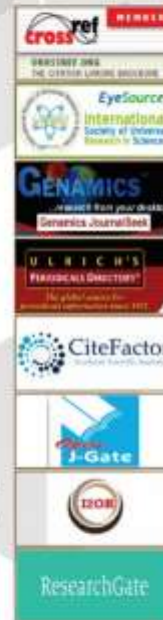
Member, Editorial Board