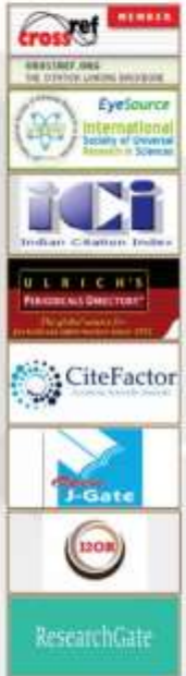
Member, Editorial Board