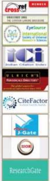
Member, Editorial Board