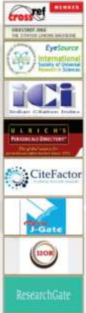
Member, Editorial Board