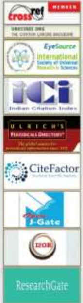
Member, Editorial Board