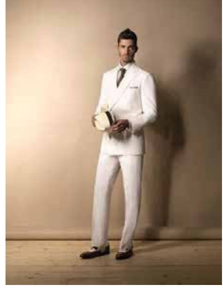
(Fig 1) White power suit by Birioni