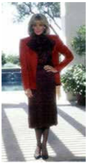
Power Dressing in the 80's