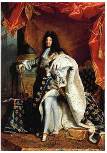
Louis XIV as a symbol of Power