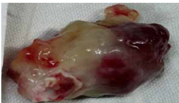
Figure 3 Excised specimen a mass with stalk a smooth grey, brown surface suggestive of atrial myxoma .