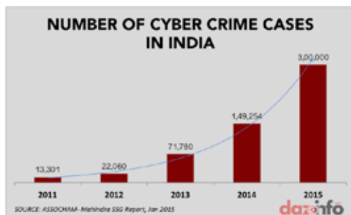
Fig.2. No. of Cyber-crime cases in India

Online banking is definitely a significant move in the right direction as far as the convenience of the customer as well as the banker are concerned but it must be applied with adequate precaution to avoid falling prey to unscrupulous elements poaching the internet.