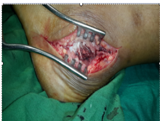
Biopsy of tumour

To confirm the diagnosis open biopsy was done by posterior-lateral approach to subtalar joint and histopathological examination showed malignant round cell tumor.