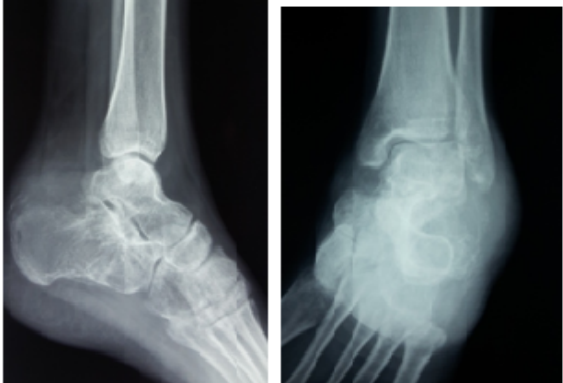
Xray of calcaneum showing periosteal reaction

Clinical Photograph The plain radiograph of calcaneum was taken at time of presentation which showed presence of sclerotic lesion in calcaneum with periosteal reaction.