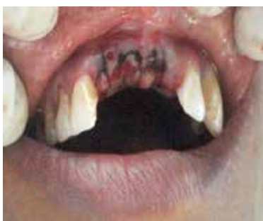
FIG 4a: SOCKET PRESERVATION wrt 11,21