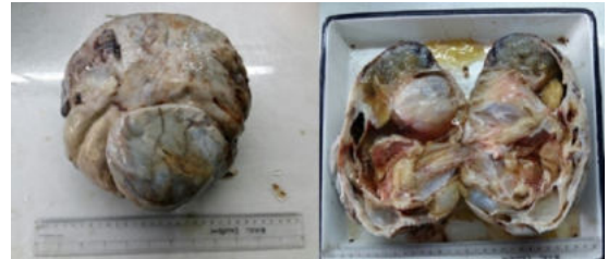
Fig. 2 Gross Specimen & Cut section showing multiple fluid filled cysts