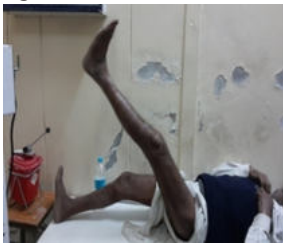
Fig 6: SLR

There were few complications encountered during follow-up and most of them were technique related. In one (1) case closed reduction was not possible for which open reduction was done and screw positioning difficulty was there in four (4) cases. There were no evidence of varus reduction, delayed union, z-phenomenon, implant failure in our study.