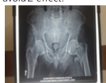
Fig 1: Preop xray of left hip with femur

Entry point is very important. It is taken over the tip of trochanter or better slightly over medial aspect of the tip of trochanter. Derotational screw should be inserted first and then the compression screw is placed after placing the guide wires in proper position. Proper anteversion of femoral neck is taken care of and varus reduction has to be avoided. Compression screw should be engaging the subchondral bone of head of femur. However penetration of the joint must be avoided. Derotational screw should be at least 10 to 15 mm shorter than compression screw to avoid Z-effect.