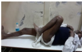
Fig 5: Flexion

These twenty (20) patients were operated and after six (6) months of follow up, the results were good to excellent in eighteen(18) patients and good in two(2) patients according to Harris Hip Score. 11 In this study twelve (12) were male patients and eight (8) were female patients. Fifteen (15) patients sustained injury by fall on ground and five (5) patients by road traffic accident. In our study fourteen (14) patients had type 3 Boyd and griffin fracture. Fracture union in eighteen (18) cases was achieved by twelve (12) weeks but two (2) cases were united only after sixteen (16) to twenty (20) weeks. Partial weight bearing was started only after four (4) weeks and full weight bearing was allowed only after twelve (12) weeks.