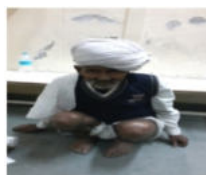
Fig 7: Squatting