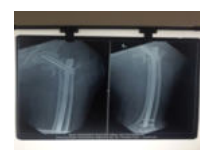
Fig 2: Immediate post op xray Showing intertrochanteric fracture