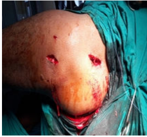
Fig 3: Intra op image LEFT HIP