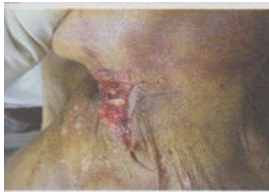
suicidal cut throat wound

The presence of cut injuries over the outer aspects of the upper limbs, palms, fingers and web spaces of the hands will denote as defense cut wounds seen in violent physical struggle involving sharp edged weapons.