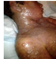
Ante mortem burn blister