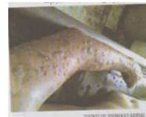
post mortem blister