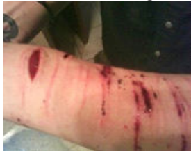
defense cut wounds over outer aspects of elbow joint