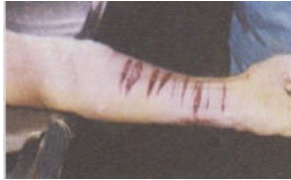
Self inflicted tentative cut wounds