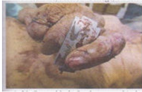
Cadaveric spasm of the Hand