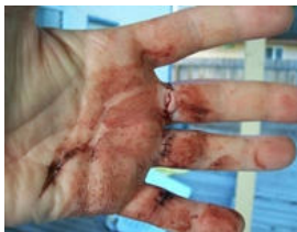
Defense cut wounds at root of the fingers

The presence of cut injuries over the outer aspects of the upper limbs, palms, fingers and web spaces of the hands will denote as defense cut wounds seen in violent physical struggle involving sharp edged weapons.