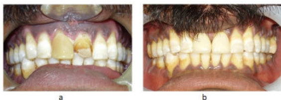
Figure 1a,b. Representative sample of the patient showing discolored maxillary anterior teeth restored using pressable glass ceramic crowns

The margins were located at the level of gingival crest or slightly into the sulcus depending upon the esthetic demands. Gingival displacement was obtained using retraction cord. Following removal of the retraction cord, poly vinyl siloxane impression of the prepared teeth were made and poured with type IV stone. The coping design of 0.6 mm thickness was made using residue free tooth colored wax and coping was fabricated by pressing the ceramic ingot as per the manufacturers' instructions. The coping was checked on the individual die and required corrections were made to receive veneering porcelain. The assessed shade of porcelain was built-up and baked. The necessary finishing protocols were carried out and crowns were bonded on to the tooth structure by using dual cured composite resin. Before bonding, inner surface of the crowns were etched with hydrofluoric acid and rinsed thoroughly with water and air dried. Tooth surface was etched with 37% phosphoric acid thoroughly rinsed and dried. Sialane coupling agent was applied onto the inner surface of the crowns and air dried. Bonding agent provided along with the dual cure adhesive resin cement was applied on the tooth surface and light cured. Required amount of adhesive resin