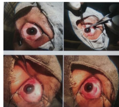
Fig 1: Steps Of Conjunctival Auto Graft Excision