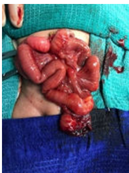
Fig 1: Ruptured giant vitellointestinal duct cyst

A one day old neonate was admitted in the surgical new born as a case of omphalocele and delayed history of passage of meconium. Child gradually developed abdominal distension requiring a laparotomy. A laparotomy was proceeded with a right supraumbilical transverse incision. The omphalocele sac was excised and the content was found to be a ruptured vitellointestinal tract cyst (Fig.1). The child subsequently underwent resection anastomosis and had an uneventful post-operative period.