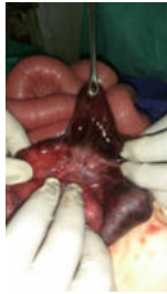
Fig4. Showing the gangrenous segment and the Meckel's diverticulum.

ileoileocolic intussusception with gangrenous ileal segment requiring resection of the gangrenous segment and an ileocolic anastomosis. Child had an uneventful postoperative period. (Fig 4)