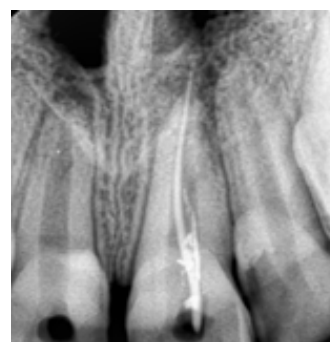
Figure 3: Pre-operative radiograph

Case 2: A 12-year old male patient reported with chief complaint of swelling and pain in relation to upper anterior teeth. The patient had history of trauma 3 months back and was treated by a general dentist after the injury. Intra-Oral Periapical (IOPA) radiograph showed open apices of #11 and #21. #21 also showed a gutta-percha point extruding through the root apex. (Figure 3)