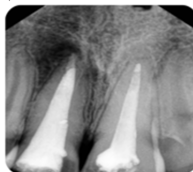
Figure 2: 14 Months follow up Radiograph

#11, a firm stop was observed in apical area of the root which allowed condensation of gutta-percha during obturation. On 1 year follow up, both teeth were asymptomatic and radiograph showed root end closure in relation to #11 but the apex was still open in relation to #21 with a period of follow up of 14 months (Figure 2). At the time of publishing this case report, #21 is still undergoing apexification.