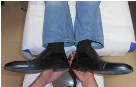
Figure 5. AMT – negative response

Lack of muscle relaxation means that thereaction is negative and there is chemoresistance to the tested drug.