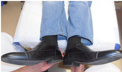
Figure 4. AMT – positive response

The patient’s response is relaxation only for one of the legs. That reaction means we have a positive reaction to the given information.