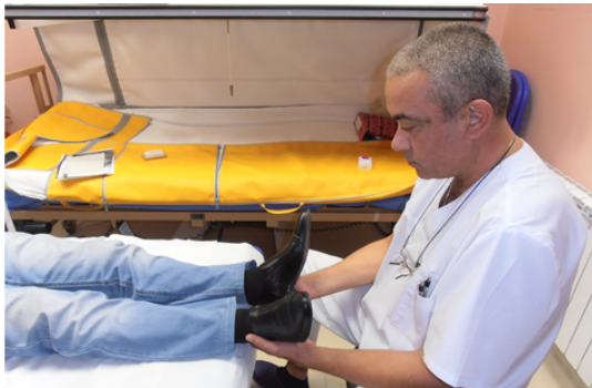
Figure 3. AMT – initial positioning

A relaxed patient has lied in comfortable position on couch. Patient’s feet are placed outside the couch. A contact with the ANS has occurred by verbal stimulation.