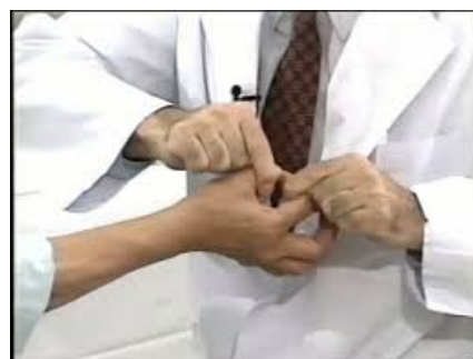
Figure 2. Bi-Digital O-Ring test

In 1993 . Dr. Yoshiaki Omura patented his Bi-Digital O-Ring Test (new AMT version) which is used for diagnostics and treatment of chronic and cancer diseases.(15)