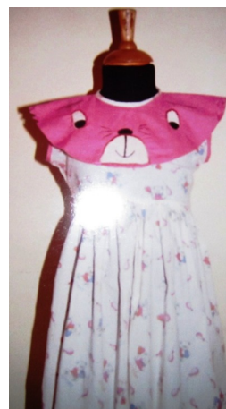
STYLE -2 COLLAR (Sleeveless Frock with a Cartoonic Collar)