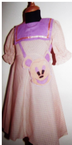
STYLE 4 – POCKET (A frock with a cartoonic purse pocket)