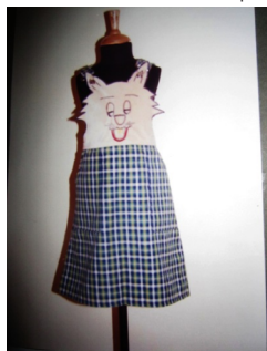
STYLE 5 – YOKE (A pinafore with a cartoonic yoke)

QUESTIONNAIRE: A questionnaire was framed to obtain the opinion with regard to function and decoration of the constructed garments. The questionnaire was then filled by 25 home scientists and 25 mothers and the reason for selecting the specific style was known.