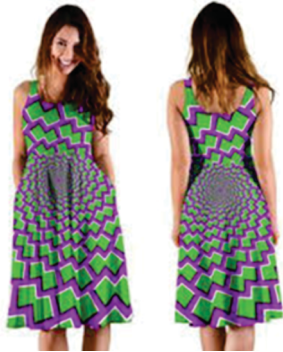
Artistically used of different hues can make ones figure most impressive(slim/Fit)