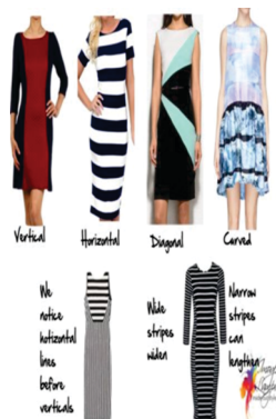
Body can look slim by using line as an optical illusion