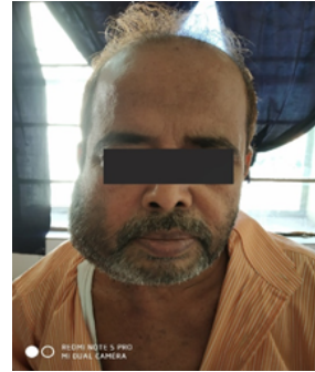
Fig 3. Right Parotid Abscess