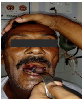
Fig 1. Showing a case of Left peritonsillitis