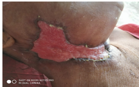
Fig 4. Right Submandibular abscess with healthy granulation tissue