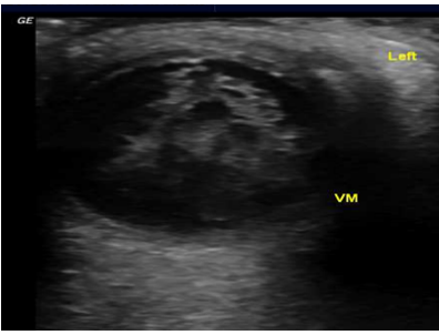
Fig 2: Vitreous Hemorrhage