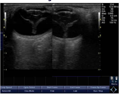
Fig 3: Retinal Detachment