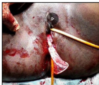
Figure 3: At the end of the procedure with the mould with amnion grafts in neovagina along with an intrauterine catheter. used surgical for raw area repair following amnion grafting 6 .

Tancer and associates reported good results with amnion grafting 2 . Karjalainen et al states that results of amnion grafting for surgical treatment of vaginal agenesis were more physiological 3 . Sarwar I et al used amnion grafting for 28 patients in 20 years with encouraging results; of course they had a case of rectal injury; they found it acceptable both sexually and aesthetically 4 . Kathpalia SK et al observed good epithelialization after 3 months; they used acrylic mould for self dilatation for 2 months 5 . Pardeshi R et al used amnion grafts and surgical in vaginoplasty. They used surgical for raw area repair following amnion grafting