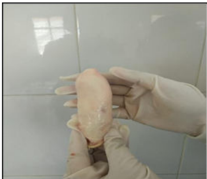
Figure 2: Showing the mould wrapped with amnion graft

with more 92.8% structural correction and 85% functional correction at the end of 1 year follow up. Few patients could be followed up for long period; 2 of them reported with successful married life with successful