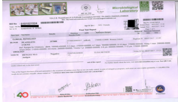
Fig:3 – Lab Report- After Treatment