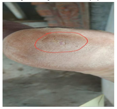
Figure A: Image view of Hindsole

were unable to get the image at the time of injury.