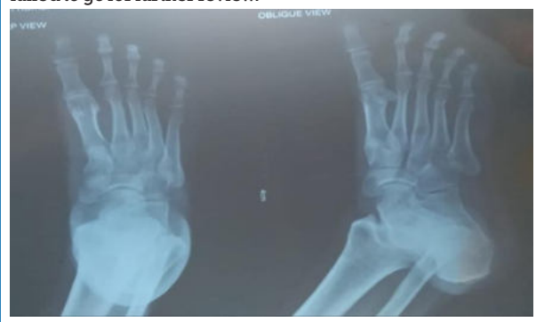
Figure B: X-ray of Right foot

The patient was given Inj.TT and T. Diclofenac sodium with Paracetamol combination to relieve pain. This particular individual's X-Ray of the right foot revealed that no foreign bodies were identified(figure:B).He was prescribed oral Ofloxacin 200 mg BD for 4 days. After the 7th day, the patient failed to go for further review.