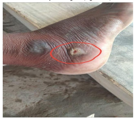
Figure C: Image view of Sub-talar joint region

On the 90th day, the patient had noticed 2 tiny pieces of wooden particles expelled out automatically from the newly formed pustules located on the opposite side of the injured site beside the sub-talar joint region (figure: C).