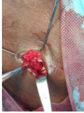
Figure 3: Intraoperative image showing intramuscular hemangioma excised by splitting up the masseter muscle

Proceeded with excision. Skin incision made over the swelling and tumour of size 2*2 is found beneath the masseter muscle. Masseter split opened, feeding vessels were lighted and hemangioma excised in toto.