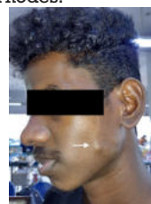
Figure 1: Clinical image of the patient showing swelling over the left cheek

no facial nerve involvement and parotid duct orifice was normal. Oral cavity examination was normal and there was no palpable cervical nodes.