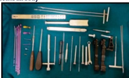
Instruments In Trolley