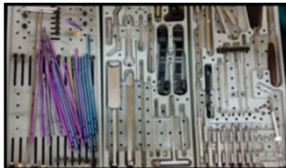
Instruments In Tray

Supraspinatus tendon was repaired carefully with interrupted absorbable sutures. The deltoid, subcutaneous tissue, and skin are closed in layers separately