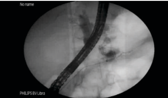
Figure -2 ERCP showing leak with percutaneous drain in situ

Three patients needed surgical intervention in the form of distal pancreatectomy and thoracoscopic drainage (table 4). There was no mortality noted in the series.