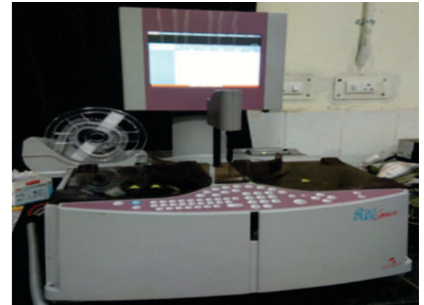
Figure: STA Satellite Automated Coagulation Analyzer