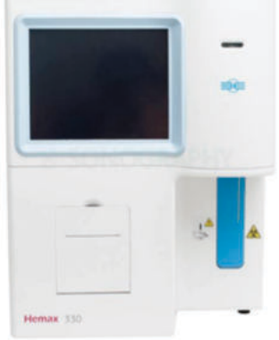
Figure: Hemax Hematological Analyzer