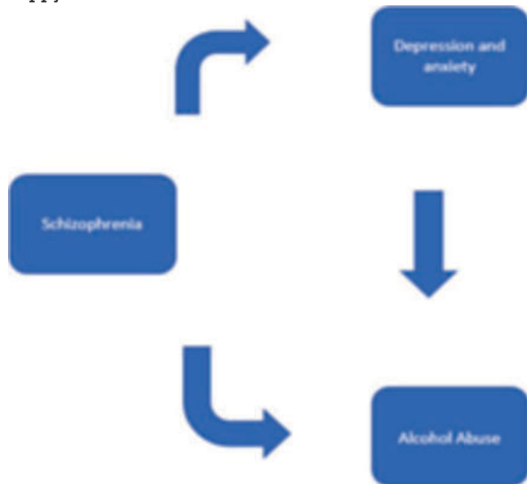
Graph 1: Relation between alcohol addiction, depression and anxiety

It's well known that patients with schizophrenia are more prone to develop substance abuse, especially alcohol. Also it's an established fact that abuse of alcohol can lead to depression and anxiety. On the other hand, depression and anxiety can also be a part of schizophrenic illness. Among patients in treatment for alcohol abuse and dependence, the prevalence of major depression is higher than in the general population. Many studies showed that people drink for a number of reasons, many of which correspond to the idea of 'self-medication' - i.e. that people believe alcohol alters their mood and feelings, and helps them to cope with situations or feelings that they find difficult. These reasons include: to relax; to make friends more easily; to feel more confident or less inhibited; to fit in socially; to reduce anxiety; to forget about problems or feel less depressed; to celebrate or simply to feel happy.