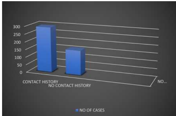
Figure 1: Contact History Of All Cases Admitted To Tertiary Care Center

Table 4 reinforces immunization status amongst the lab confirmed cases considering the sample sent during the study period.