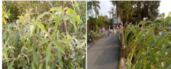
Figure 1: Vitex negundo L. leaves

Vitex negundo L. belongs to the family of Verbenaceae and grows as small tree with thin grey bark and green leaves. Vitex negundo L., commonly known as the Chinese chaste tree, five-leaved chaste tree, or horseshoe vitex . It is a large aromatic shrub, widely used in folk medicine, particularly in South and South Asia. The common name of Vitex negundo L. is Nirgundi, Nishinda, Samalu (Smrity et al., 2019).