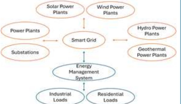
Figure 3: Energy Management System Integration

The total number of power grid and the infrastructure available in India and United States was documented for available room for new smart meters. The focus was around to utilize a large incorporation of smart meters in to the Indian grids to ensure smart grid transitioning faster. However, the concept of energy management integration to smart grid is known but they are being studied separately. An application integration is practically feasible solution to allow customer to track their power usage and other preferences. Concept for communication was developed in Fig. 3 that show cases how an integrated manner of communication can happen from either wireless or fiber optic network.