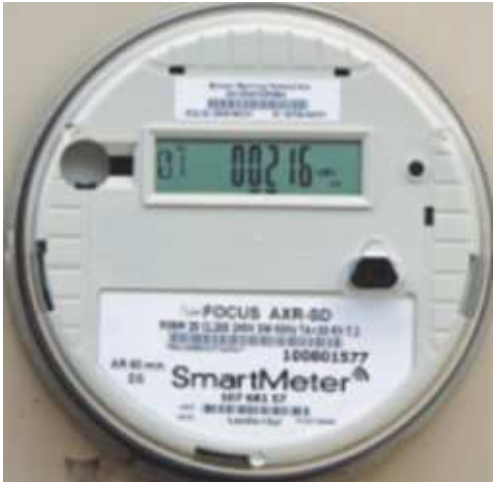
Figure 1: Comparison of Smart and Analog Meter