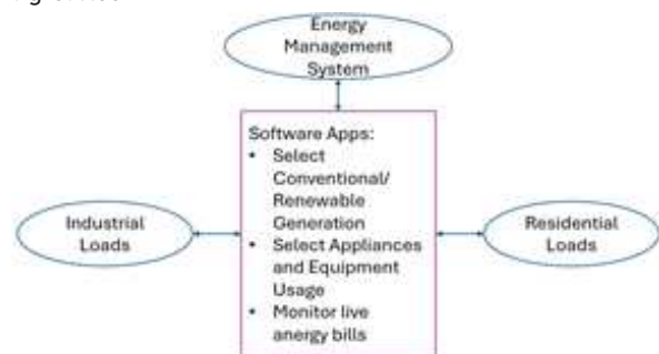
Figure 4: App integration for Energy Management System

energy bills. Some users that are cautious about their carbon credits earnings from their switching to energy efficient options using the apps will find the Figure 4 app integration as a great tool.